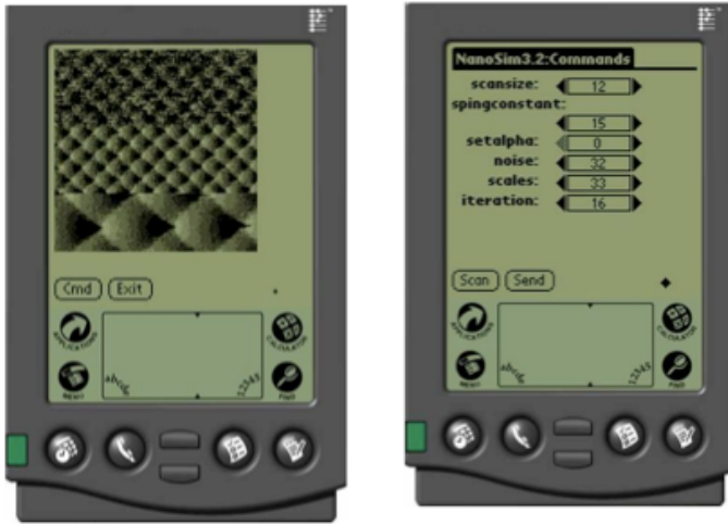
Figure 4. NanoMobile remote steering interface on a PDA. Left: View of an observed surface with atomic resolution. Right: List of gauges to view and adjust experiment parameters.

that she needs to take action. Human supervision is only necessary in case of malfunction, extraordinary events or termination of the experiment. The mobile client and a notification system allow students and researchers to supervise their experiment in the most time-efficient manner.