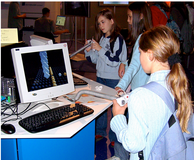
Figure 3. Youngsters making their first manipulation experiments at the nanoscale level. Three interconnected Nanojoystick stations were presented at the Sciencedays in Rust, Germany, attended by nearly 20,000 prospective students.

In the context of science communication events such as the Sciencedays in Germany [18], the Nanojoystick is an ideal demonstrator to invite scholars to get in touch with science (see Fig. 3). The use of several stations with competition through a global ranking is well suited to involve not only single, but small groups of visitors. The high-precision control of the tip via the joystick has been appealing to both girls and boys.